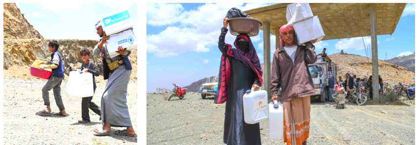
Distribution of RRM kits among displaced families in Al Mahwit and Kuser