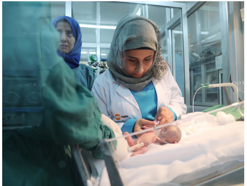
Emergency obstetric care provided at Al Kuwait Hospital in Sana'a provided with UNFPA support, © UNFPA Yemen