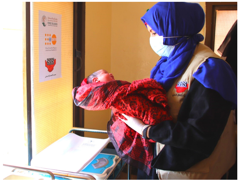
Safe delivery at a UNFPA-supported health facility in Socotra, Yemen