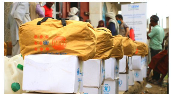
Distribution of rapid response kits in Al Jawf and Marib Governorates.