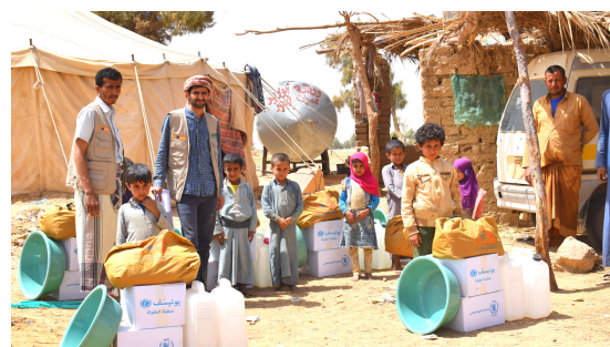
Distribution of rapid response kits to displaced families in Al Jawf and Hadramout