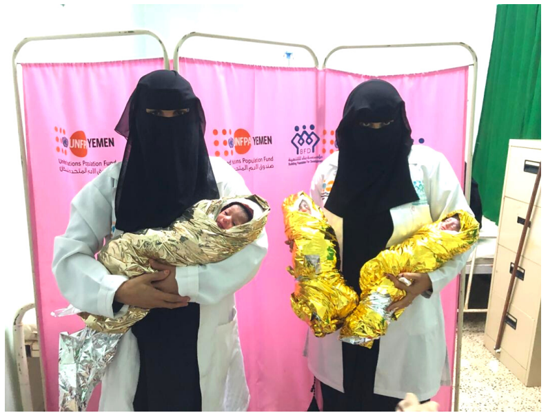
Safe births at Azan Health Centre in Hajjah