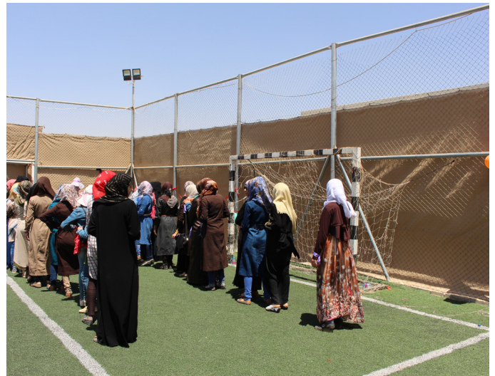
Sports and recreational activities conducted for women and adolescent girls at the UNFPA-supported youth centre in Zaatari camp in conjunction with World Population Day.

My journey began when I started attending awareness raising activities and trainings being conducted at the UNFPA-supported youth centre in Zaatari camp. I found out about the youth centre through an outreach campaign. At the youth centre I gained many new skills that opened new doors for me. Before I came to the centre, I felt I had nothing, and now the skills and opportunities that I have acquired are allowing me to live with success in Zaatari camp. The staff at the youth centre helped me develop my skills and also helped in drafting my own CV. As a result of the skills I acquired, currently I am working at IRD (an NGO) and providing services for other youth. I want to thank the team at UNFPA-supported youth centre for all the support they have been consistently providing me and to other youth at the centre in Zaatari camp. As Mahmoud Darwish wrote, "I will become someday who I want to be."