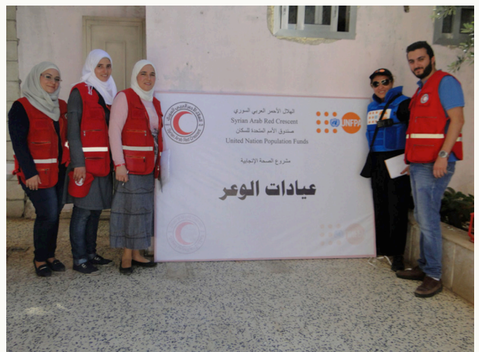
UNFPA, in cooperation with the Syrian Arab Red Crescent (SARC), launched the first reproductive health clinic in Al-Waer, Syria.

"The psychosocial support sessions were an opportunity to meet other participants and we became friends. I also discovered things about myself that I was not aware of. The inner character of me, the true me was buried deep down, but suddenly after I gave it the space to come out, I became more of myself. I have started to feel that I exist. Now I count the days waiting for the next session. I thank everyone for the efforts and contribution giving us the chance to breathe again after lots of suffocation, loneliness and isolation," said a Syrian woman who participated in several activities that took place in one of the safe women spaces supported by UNFPA in Cairo.