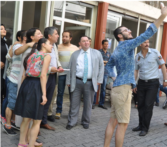
Kirikhan Youth Centre opening, Turkey.