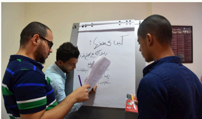
Participants in a training on peer education on youth sexual and reproductive health in Saïda, Lebanon.

Due to the instability of the local currency exchange rate against the US dollar, some vendors delayed the delivery of necessary equipment to some safe spaces.