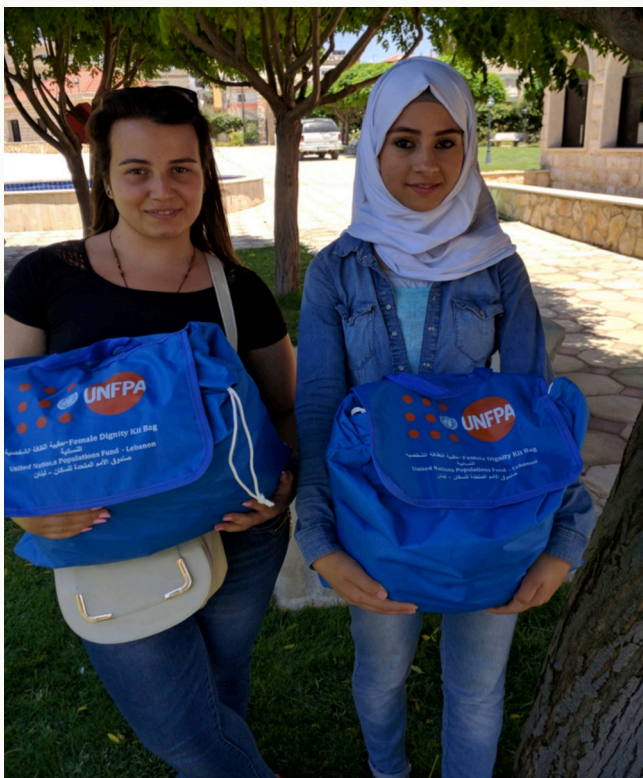
Two young Syrian refugees who received dignity kits at Qab Elias, Lebanon, part of the Skills 2 Learn Project implemented by SAWA Association for Development with the support of UNFPA.

UNFPA teamed up with UNHCR and the Ministry of Social Affairs and co-led the July SGBV task force meeting where the roll-out plan for the SOPs was discussed and agreed upon.