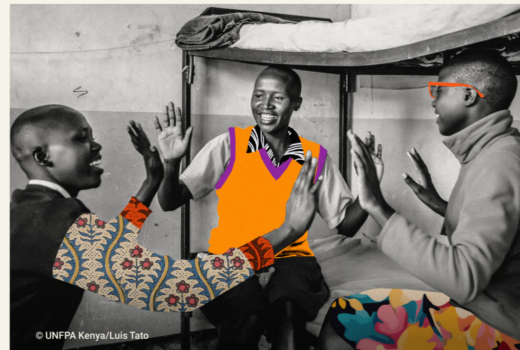
A group of girls rescued from female genital mutilation and early marriage play hand-clapping games in their dormitories at Morpus primary school in Ortum, West Pokot, Kenya.

To the best of our knowledge, the current study is one of the first to provide an in-depth analysis of factors associated with the perception of ease in practising FGM across borders and the intention to mutilate daughters or female relatives in cross-border communities in Ethiopia, Kenya, Somalia and Uganda. Specifically, the study intends to estimate the odds related to the ease and intention to practise FGM and identify factors associated with both.