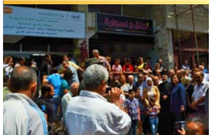
A UNFPA-supported clinic was officially inaugurated in collaboration with the Syrian Family Planning Association in Wadi al Nadara, in west Homs in Syria. At this clinic, reproductive health services will be delivered to women and young girls, including hundreds of internal displaced women from nearby villages.