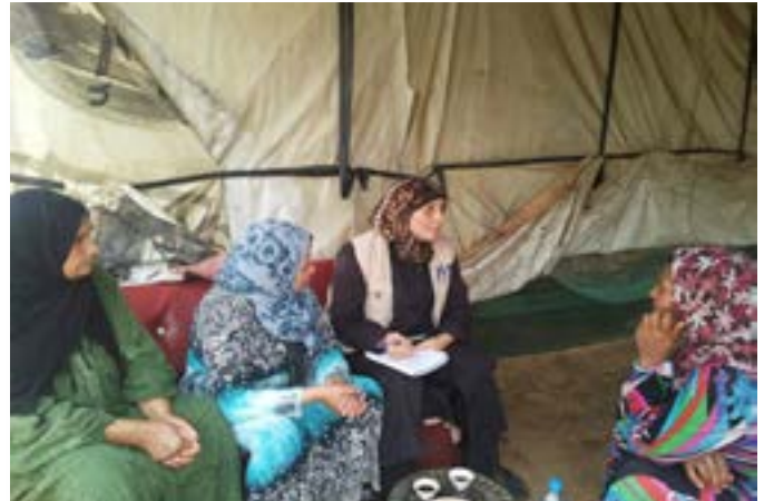
A community health worker conducting an awareness session in an informal tented settlement in West Bekaa, Lebanon.

GENDER-BASED VIOLENCE OUTREACH SERVICES: Raising awareness on environmental issues has become imperative in