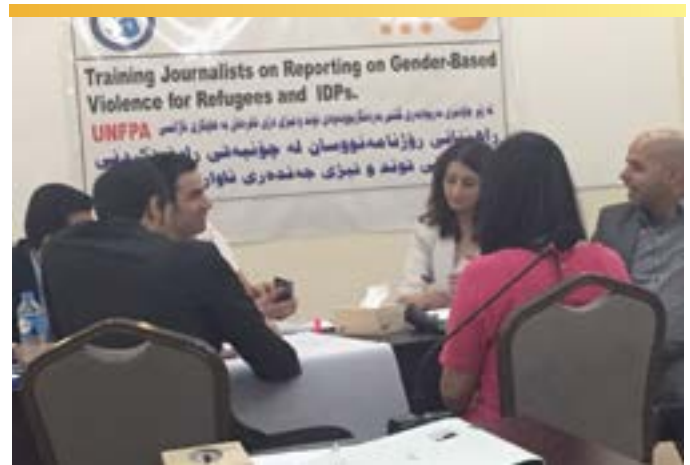
Journalists participating in a training on 'Reporting on gender-based violence in conflict, Erbil, Iraq.

based violence specialized reporters network, which will work to build the capacities of other journalists in the three governorates on the same issue.