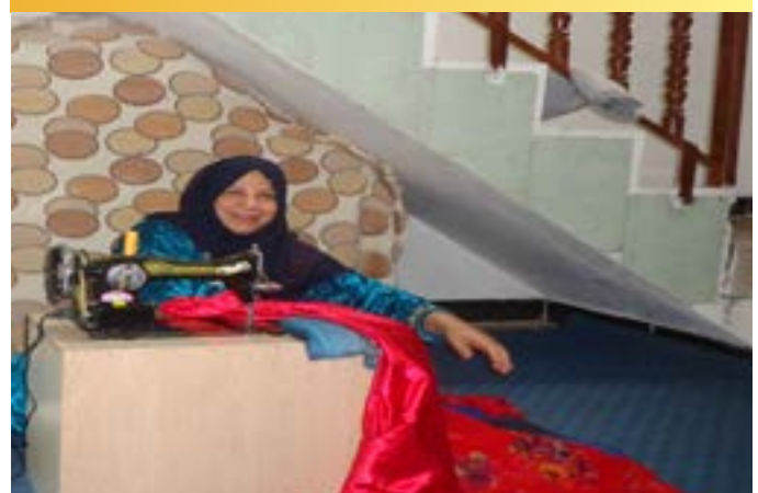
Displaced Iraqi grandmother symbolizes resilience and conviction

A total of 15,300 health brochures were distributed to different NGOs -- IMPR, Support to Life, AAR Japan, and DRC in Sanliurfa and Yuva Association in Hatay.