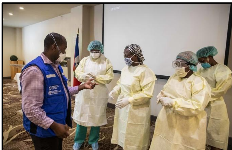
UNFPA helps Haiti fight COVID-19.

PORT AU PRINCE, Haiti - Emergency services have just been reopened after the decontamination at the Immaculée Conception Hospital (HIC) of Port-de-Paix, in the North West of Haiti.