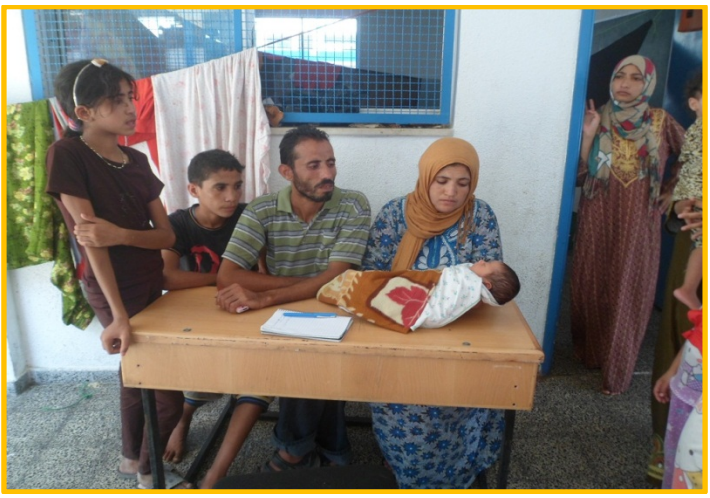
UNRWA shelter, photo taken by Osama Kahloot.