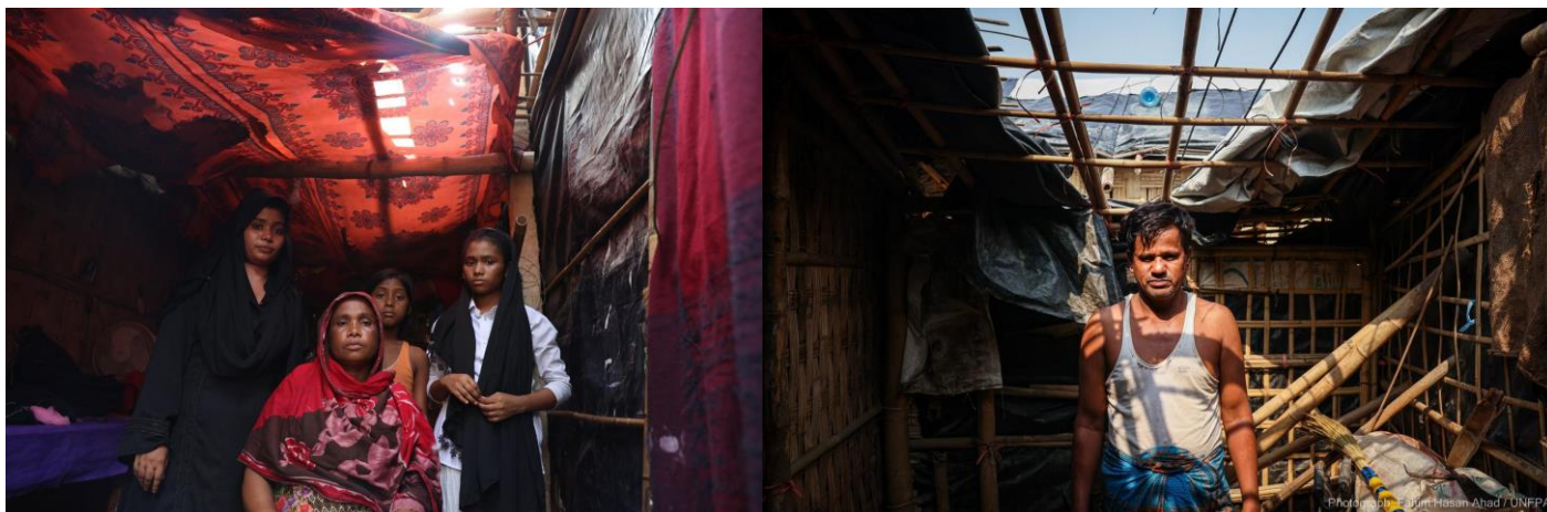
Affected families due to the devastating cyclone MOCHA.