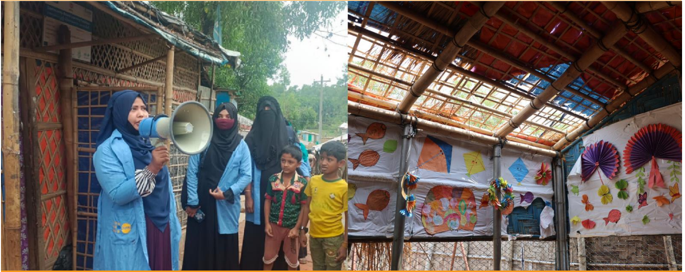
Preparedness of Cyclone MOCHA