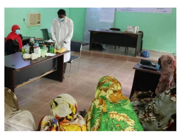
Linking skills training on making soap and COVID-19 awareness