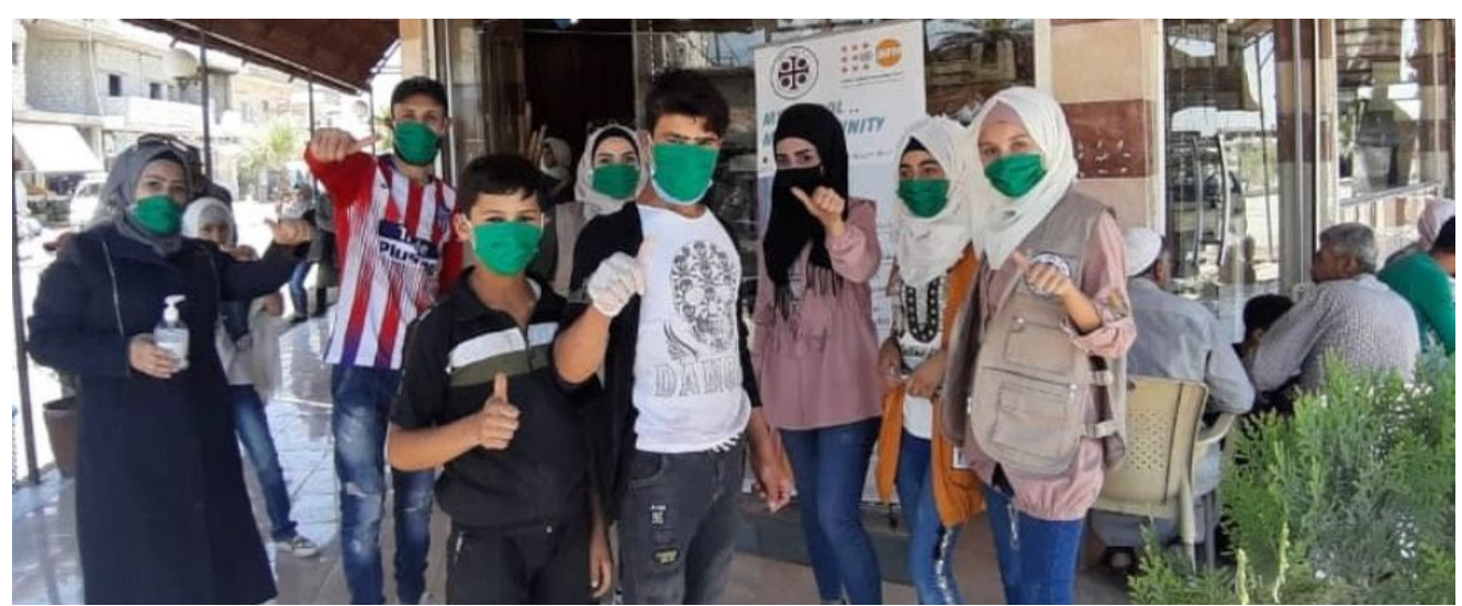
Celebrating International Youth Day in rural Hama awareness and