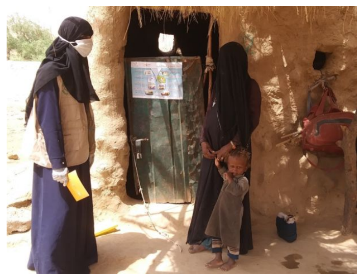
Raising awareness on COVID-19 in collective sites