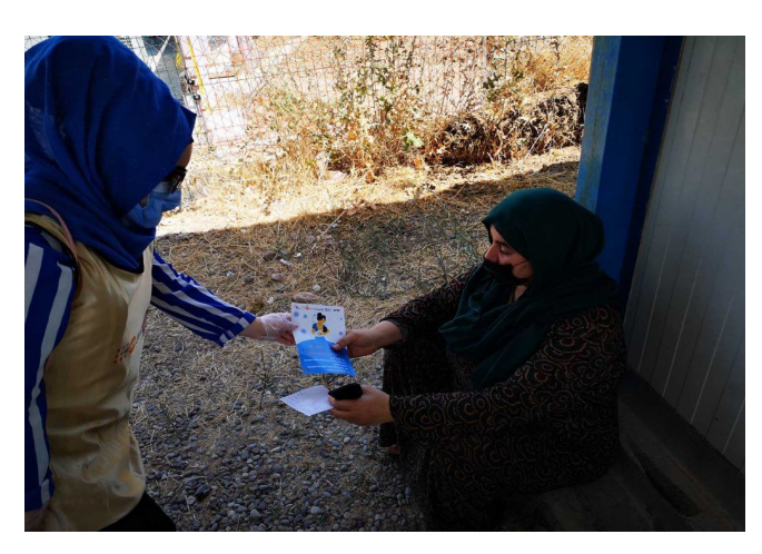
Risk Community and Community Engagement on COVID-19