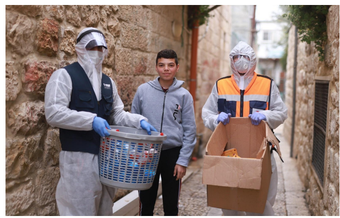
Palestine Y-Peer network distributing hygiene supplies during COVID-19 pandemic