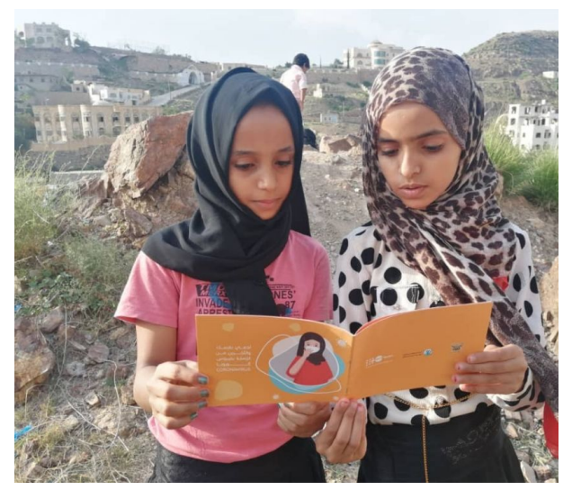
Raising awareness on COVID-19 for young girls